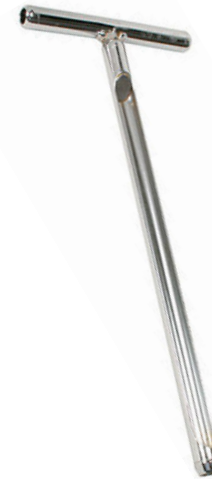
Soil Sampling Probe